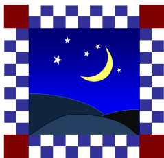
Cold Night Quilting