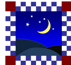
Cold Night Quilting